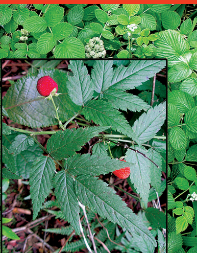
Native Raspberry, don't confuse with Blackberry