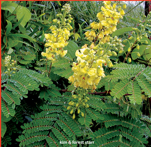
kim & forest starr