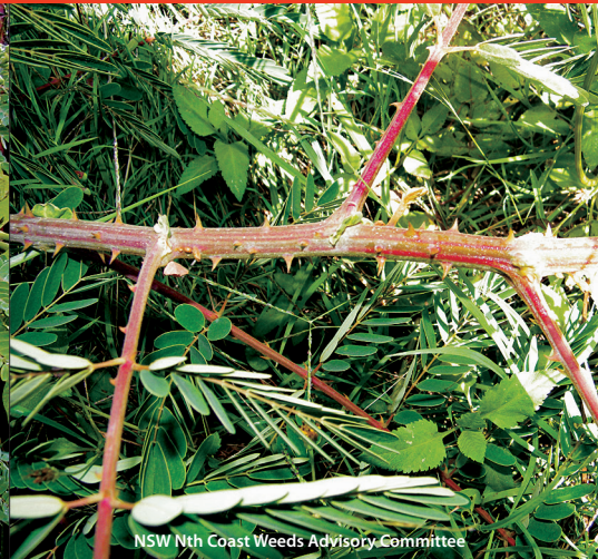
NSW Nth Coast Weeds Advisory Committee