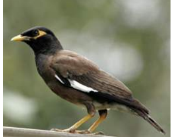
Common Myna (pest)