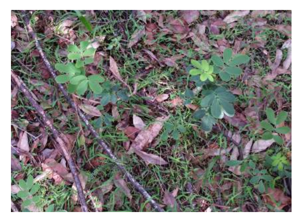
Senna seedlings, Pacific Villas