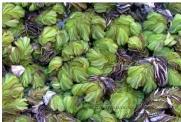
Tertiary Growth Form of Salvinia