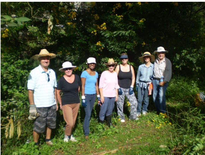
Kinchela Landcare members at their first working bee in April

Welcome to the new Kinchela group and its members! Wishing you many happy days landcaring at your site.