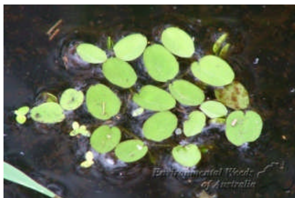
Primary Growth Form of Salvinia

If you have Salvinia at your landcare site, dam, or have noticed it in a waterway near you – please let CHRL know. Two of our landcare members attended the workshop and are keen to get involved in trials using the weevil in the Coffs Harbour region.