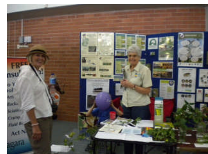
Coffs Harbour Show 13th May