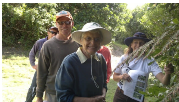
Happy landcarers at the Coastal Plant ID Workshop 2nd May