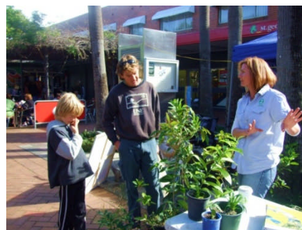
World Environment Day 5th June