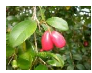
Brush cherry: Fruit is ripe when dark pink and soft.