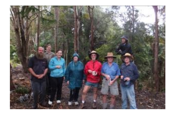
Treefern Creek volunteers

This funding also allows us to visit landholders who would like to receive advice and planning for restoration activities on their properties. Please get in touch with the office if you would like to be considered for the next round of funding.