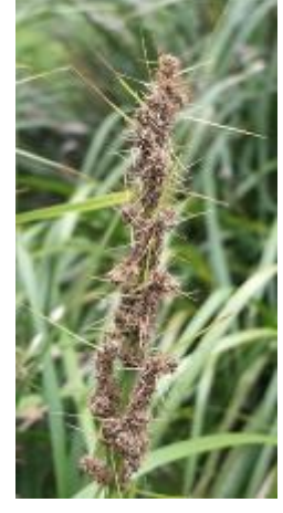
Female plant with immature seeds (left)

Lomandra hystrix: As L. longifolia, but ripens later in summer (February).