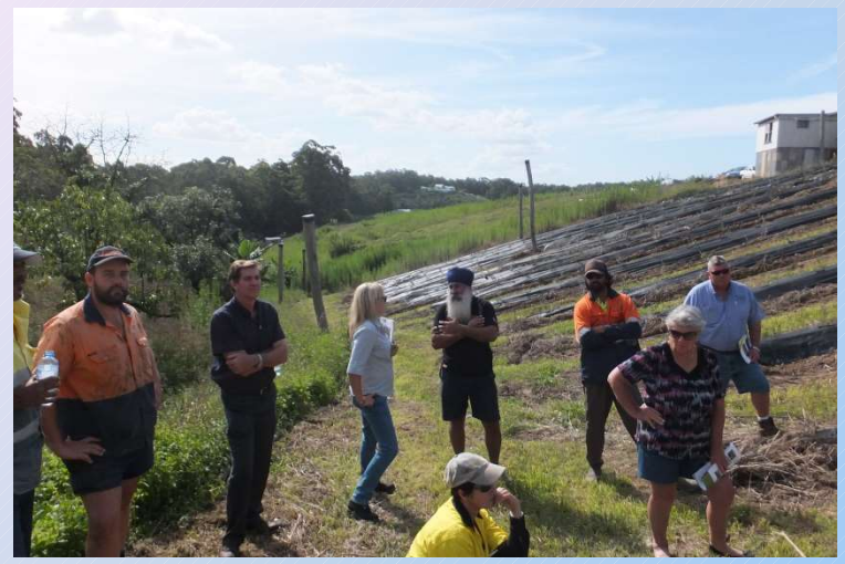
Erosion Control on Blueberry Farms