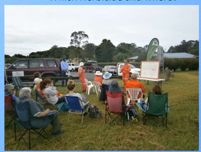
Bush regeneration Principles and techniques, Bakker Drive