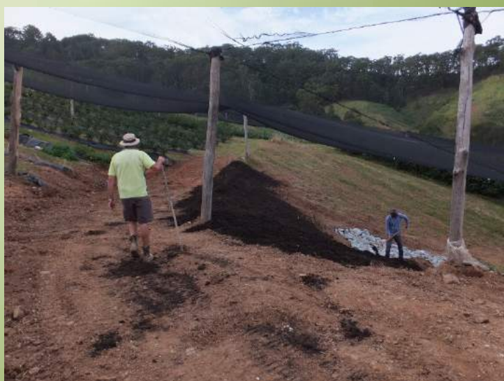
Implementing Soil & Water Management Plan