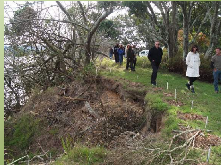
Field event, Mylestom riverbank