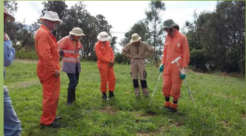
Bush Regeneration – Wick Wipers