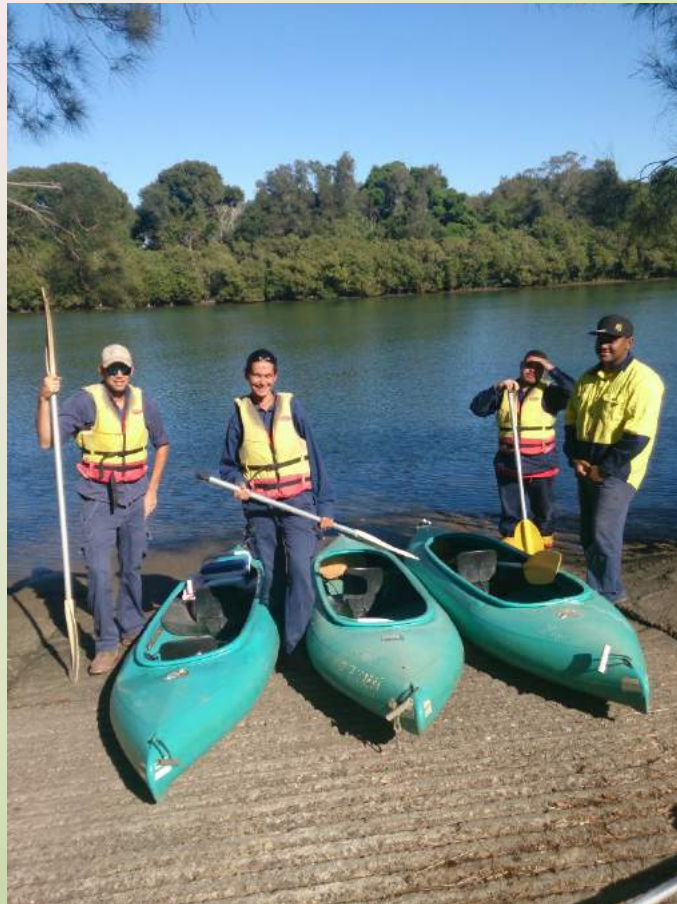
Darrunda Wajaarr team ready to paddle to work