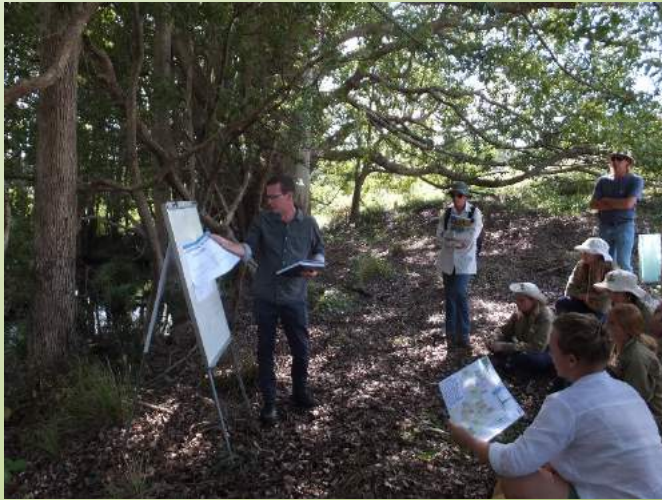
Revegetation techniques, Bucca