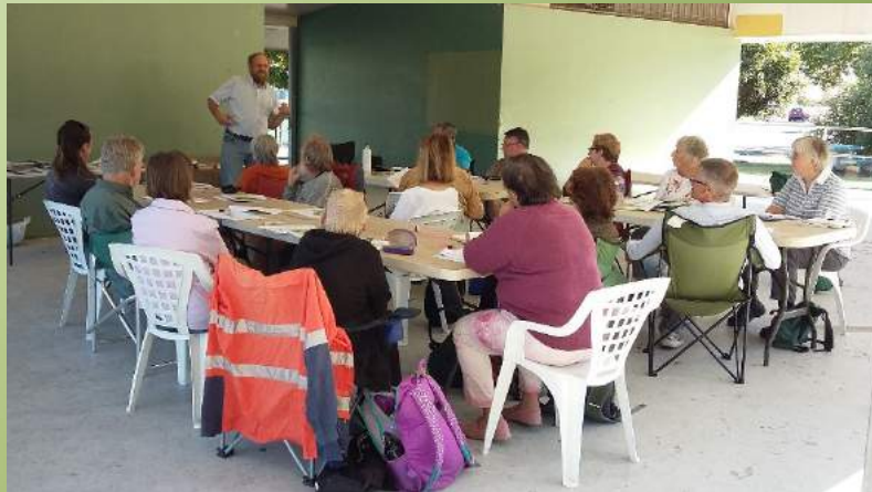
Coastal Plant I.D.