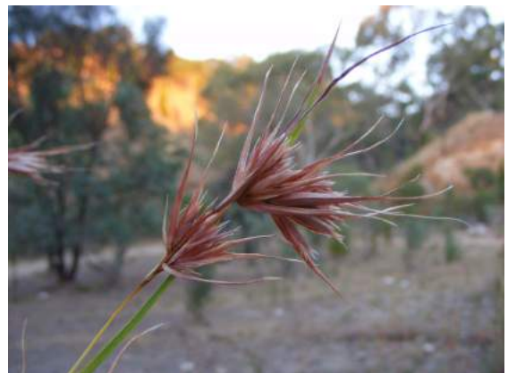
Kangaroo Grass - Themeda australis