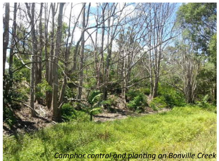
Camphor control and planting on Bonville Creek

Weed control is of course as usual the main activity with tree planting important to convert the steep lands back to native forest.