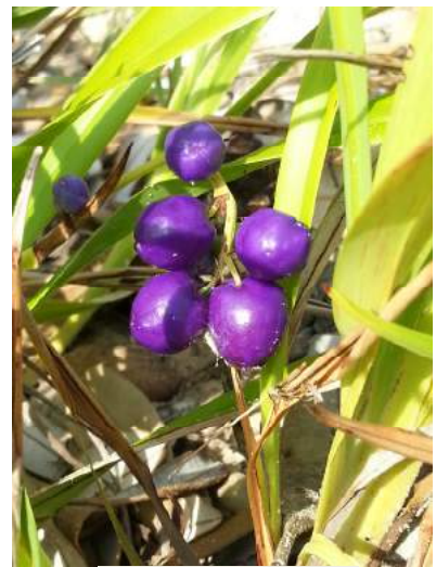
Coastal Flax Lily