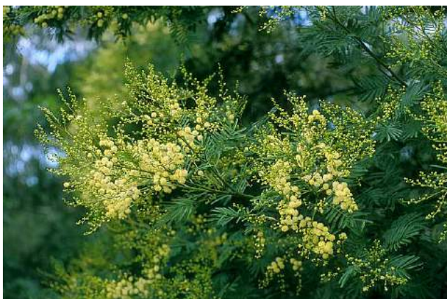
Green Wattle - Acacia irrorata